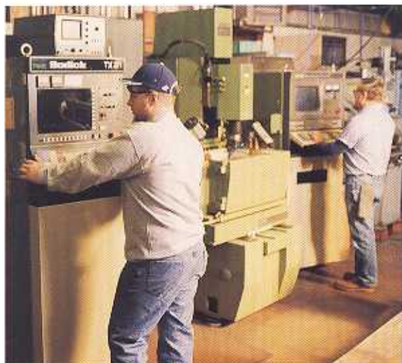
Our vertical CNC EDMs cut down on manufacturing time by saving rough and finishing steps.