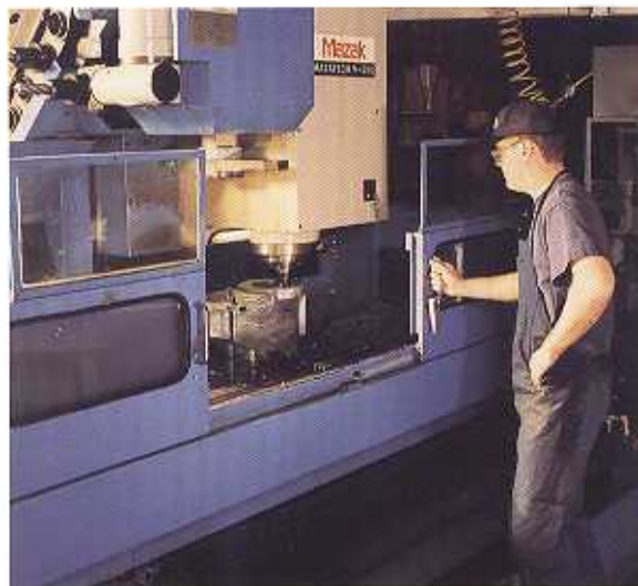
We offer great flexibility with this four-axis vertical CNC machining center, the largest of our four CNC centers.

able of tolerances to one ten-thousandth of ls combine with our skilled operators and als to achieve this high level of precision.