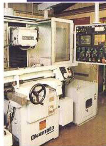
This CNC surface grinder offers superior precision in radii and shapes.