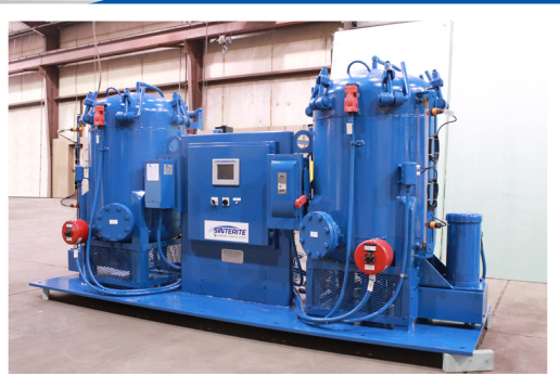
Dual Tank Oil Impregnator

Sinterite is a leading manufacturer of fabricated alloy and mild steel products specific to the powder metal industry. From powder processing to parts handling, Sinterite provides a wide range of fabrication capabilities that can be customized to meet each customer's unique needs and applications.