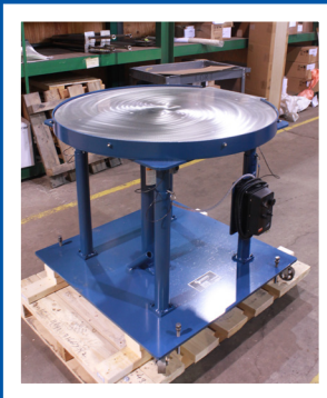
Rotary Parts Accumulator (RPA)