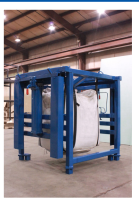
Powder Bag Handler