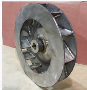
High Temp 600 Stainless Steel Fan Blade