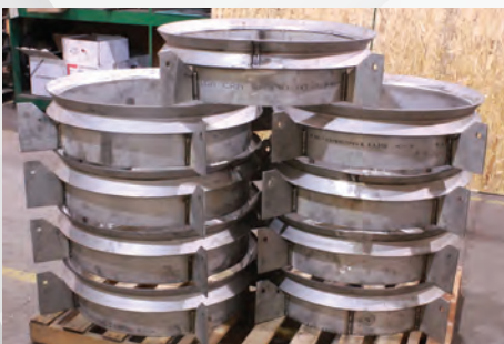
High Temp Stainless Steel Fan Shrouds